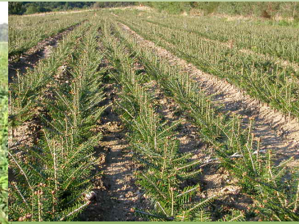
2+2 (4 yr old) Abies alba

which are all covered by the FRM Directive