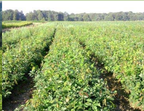
1u1 (2 yr old) Quercus robur