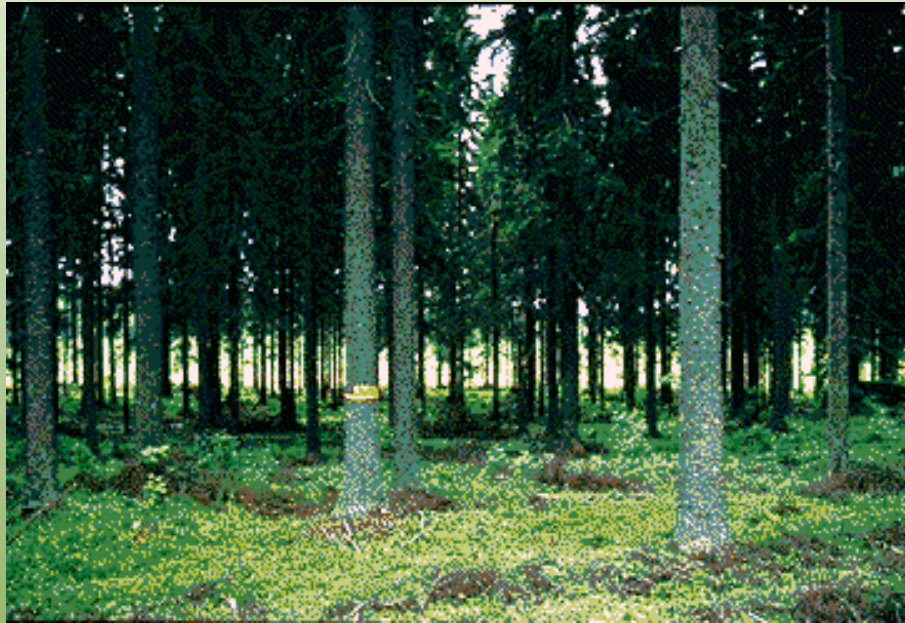
Plus tree Pinus sylvestris Finland