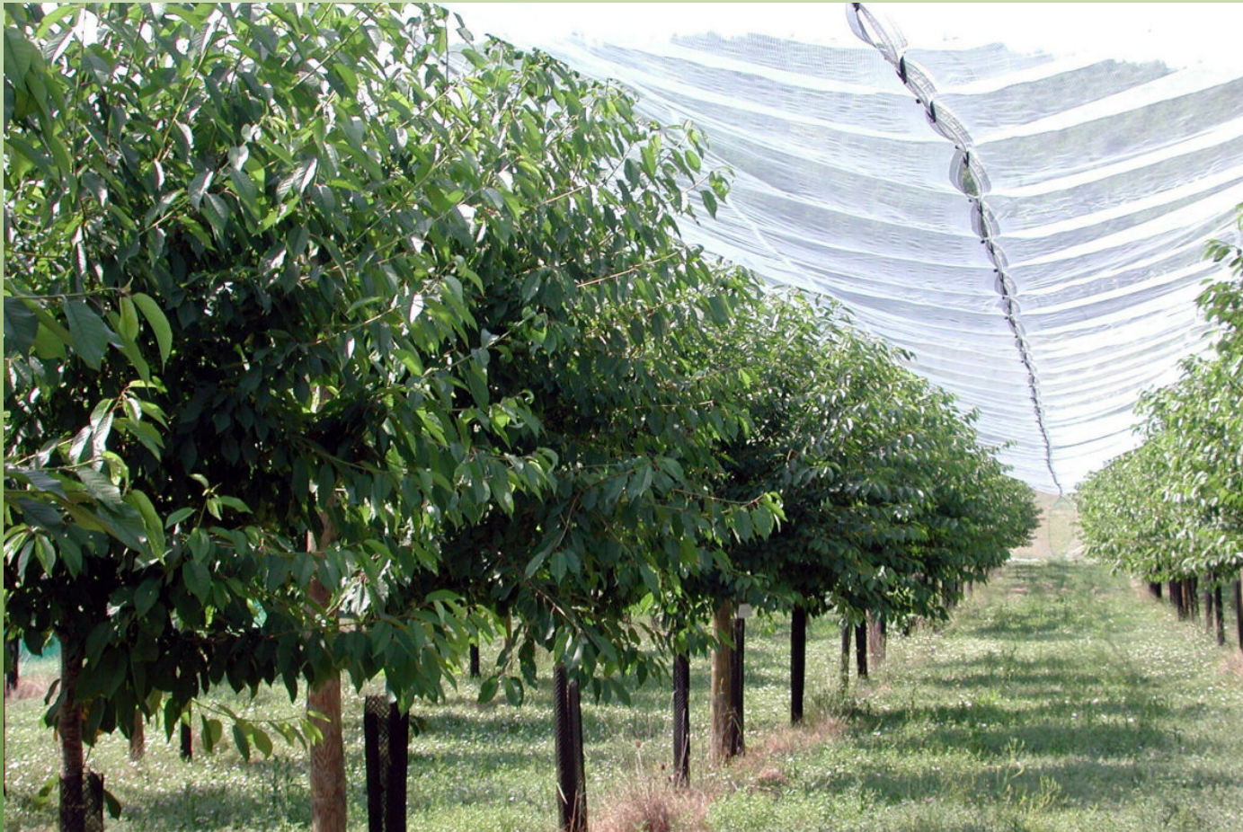
Frost/bird protection on Tested Prunus avium Seed Orchard France