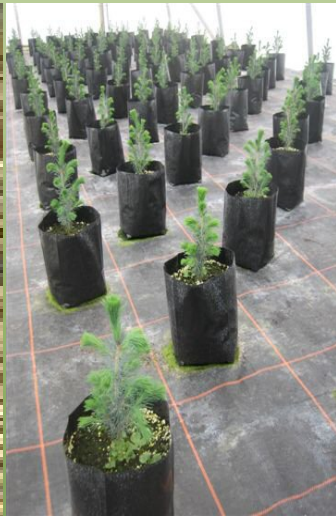
Picea sitchensis cuttings