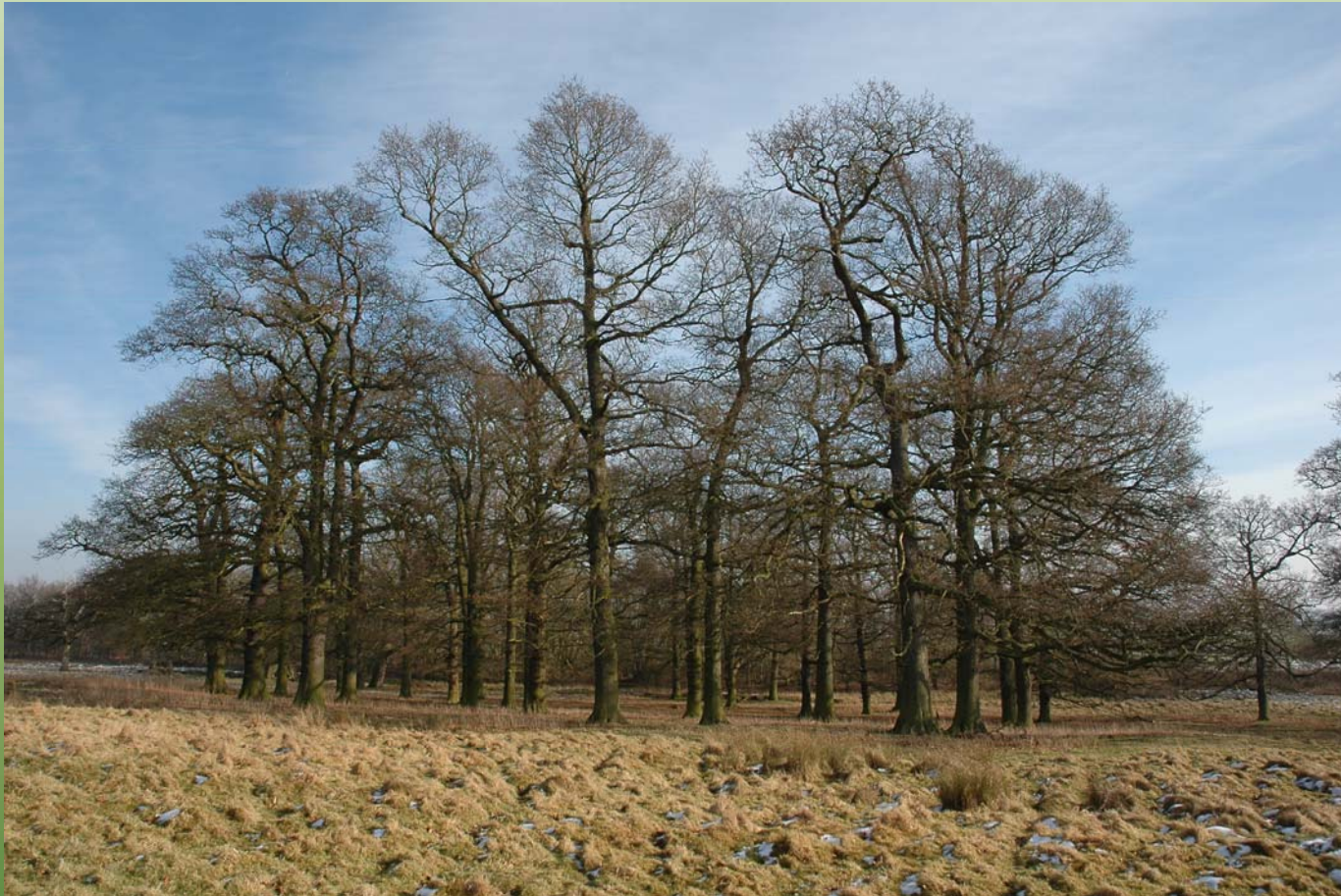
Stand of Quercus robur