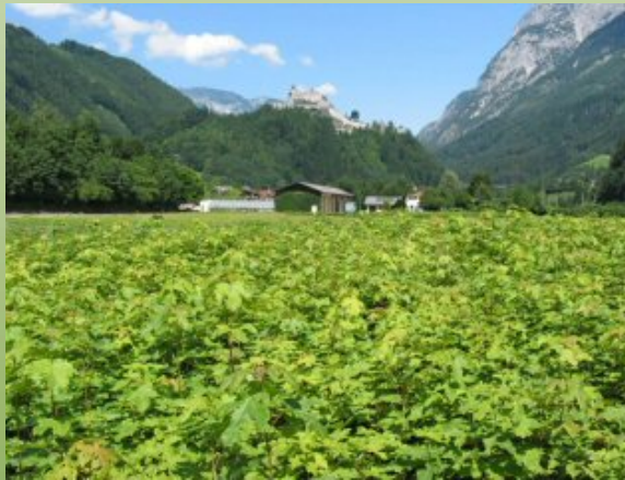
1-year old Acer pseudoplatanus