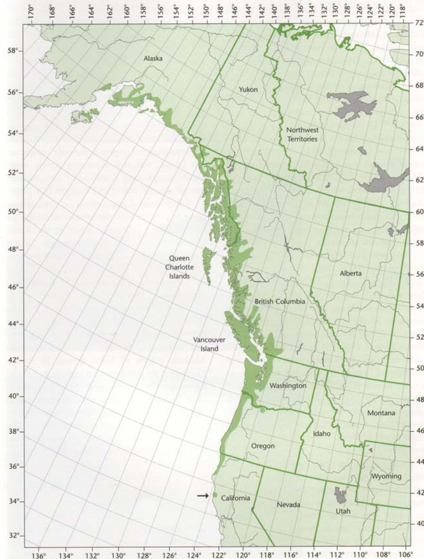
The natural distribution of Sitka spruce (→ indicates disjunct population at Jug Handle Creek, California).

The natural distribution of Picea sitchensis from Forestry Commission Bulletin 127