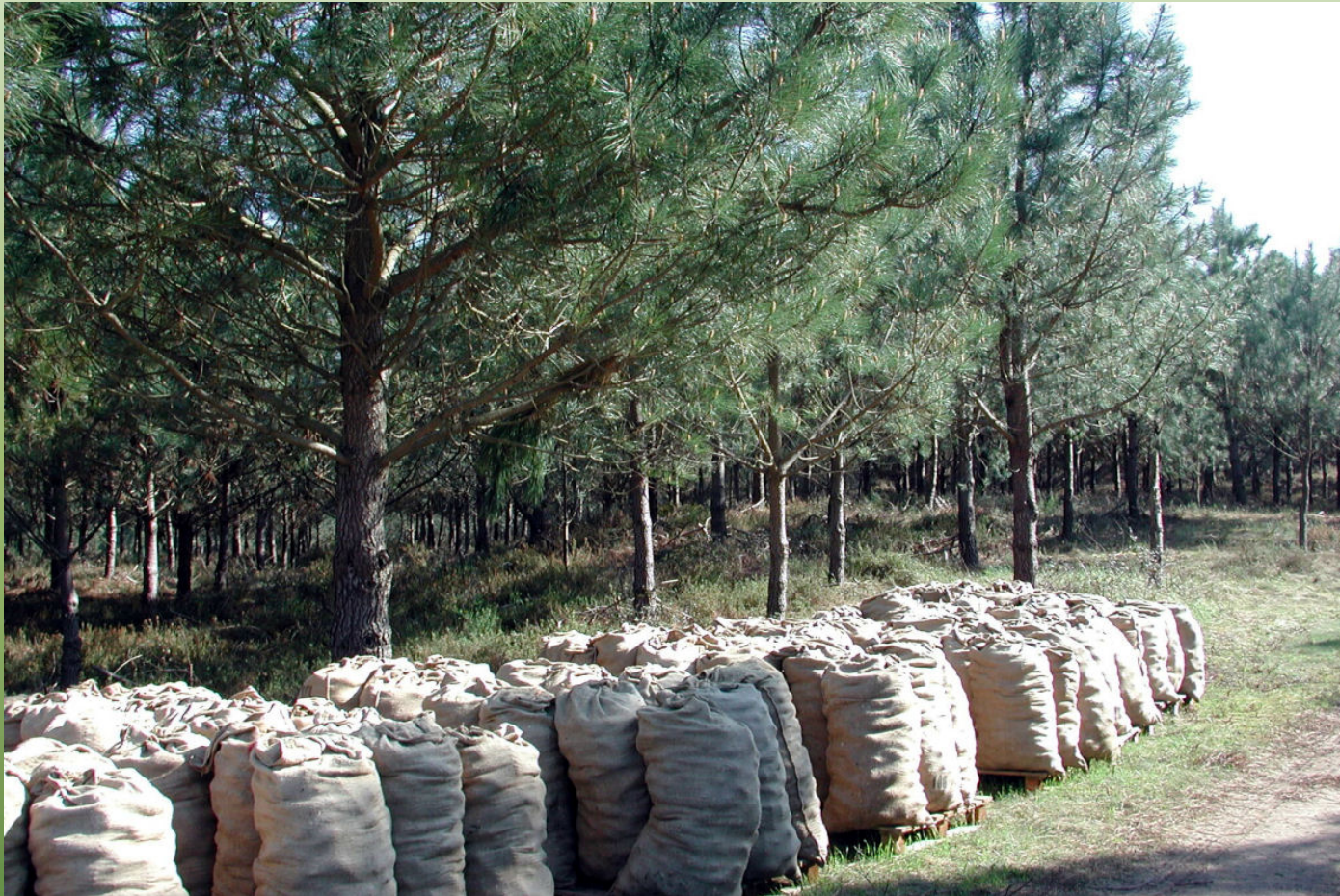
Cone sacks in Pinus pinaster seed orchard SW France