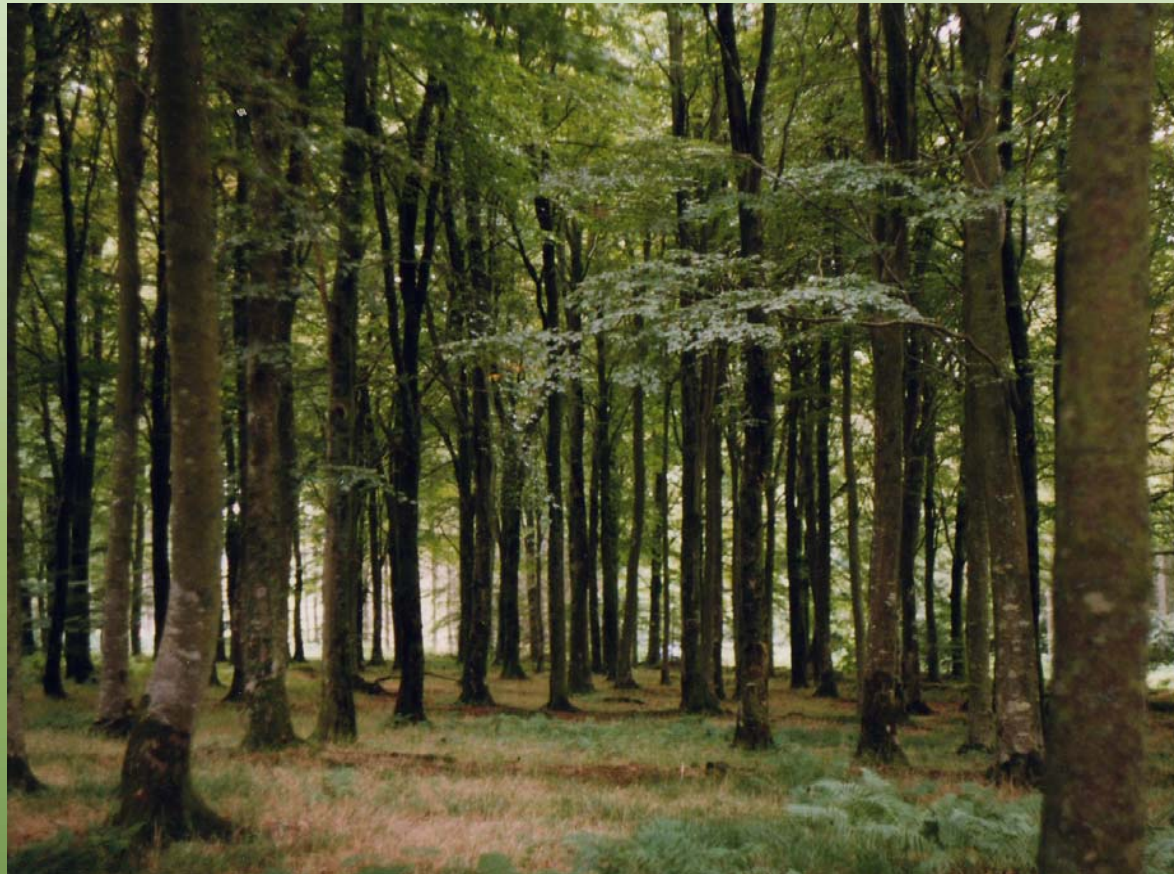
Stand of Fagus sylvatica , Langholm, Scotland