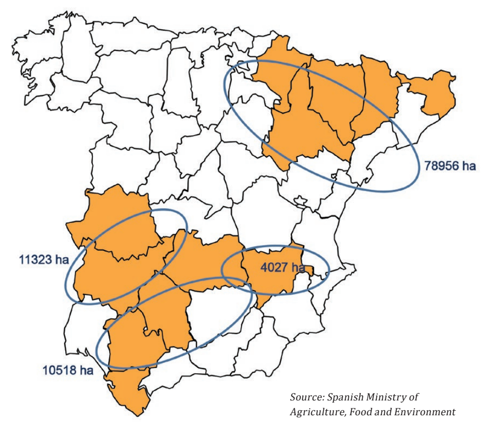
FIGURE 1. Main production areas of GM corn in Spain.

Each purchaser of GM maize receives the ANOVE technical guide, containing the latest information on growers' IRM obligations. In addition to widespread dissemination of information pertaining to refuge requirements to technology users, a grower education programme with sales and agronomic advisory