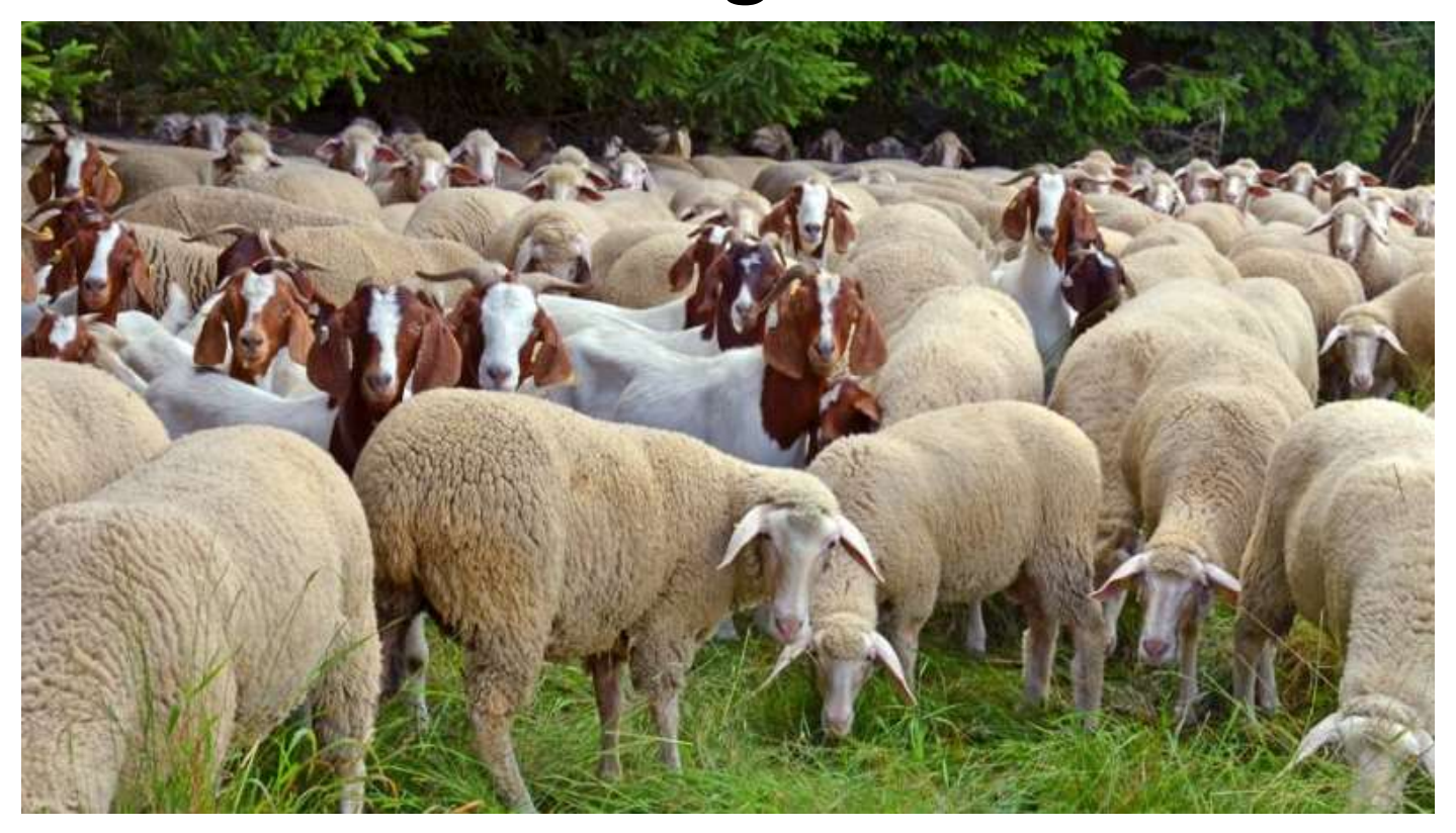
SC PAFF, 16-17/12/2024