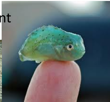
Lumpfish Cyclopterus lumpus