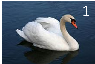
Mute swan Cygnus olor