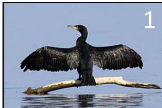
Comorant Phalacrocorax carbo