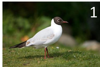
Black-headed gull Chroicocephalus ridibundus