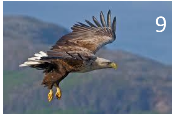
White-tailed eagle Haliaeetus albicilla

71 birds tested and 18 positive for H5N6.