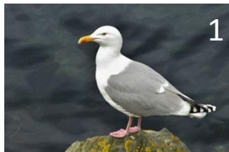
Herring gull Larus argentatus