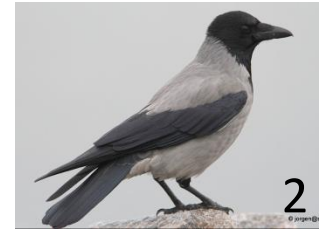
Gray crow Corvus cornix