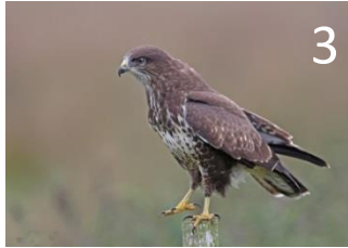
Buzzard Buteo buteo