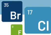
Table 9 (continued)