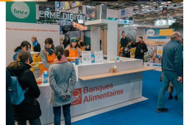
Salon International de l'Agriculture