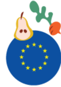
EU Fruits and Vegetable Withdrawal Scheme Food Banks (in tons)