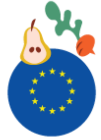
EU Fruits and Vegetable Withdrawal Scheme Food Banks (in tons)