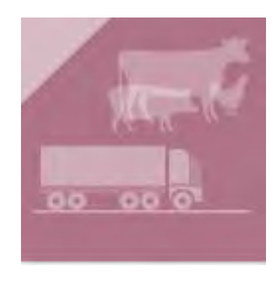
F2F - Enforcement of animal welfare during transport