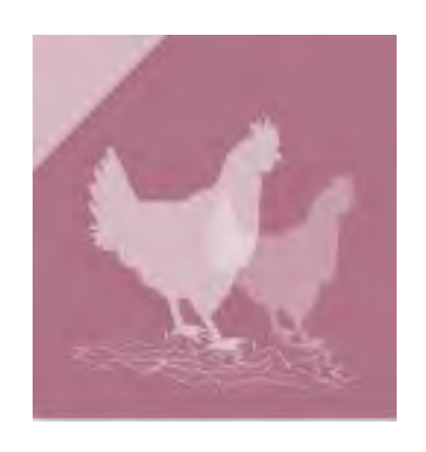
Broiler welfare on farms eLearning module