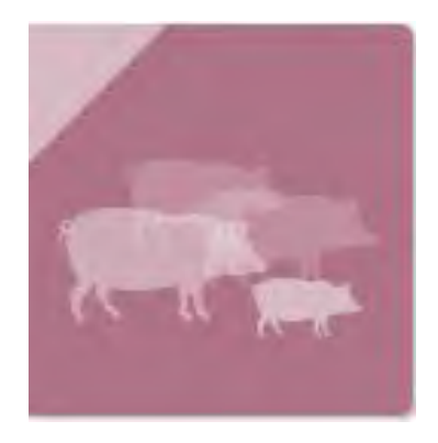
F2F - Animal welfare in pig production