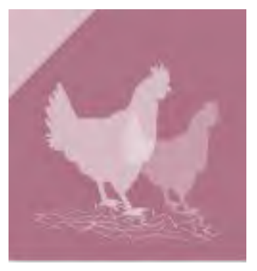
F2F - Animal welfare during transport (advanced)