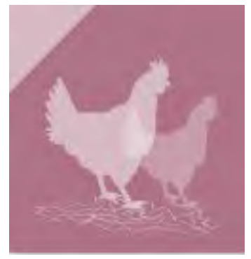
F2F - Animal welfare in poultry production - broilers