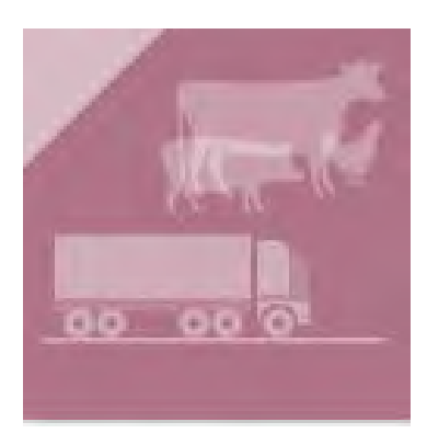
F2F - Animal welfare Retrospective checks on transport of animals