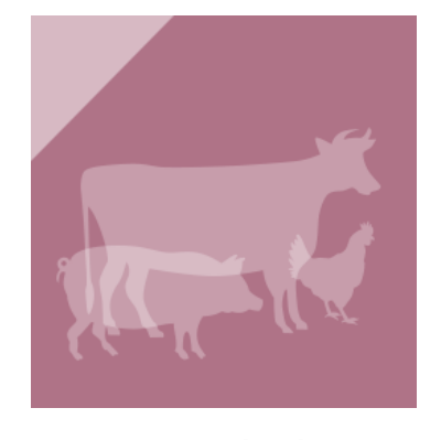
F2F - Animal welfare at slaughter and depopulation (basic)