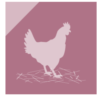
F2F - Animal welfare at slaughter - poultry (advanced)