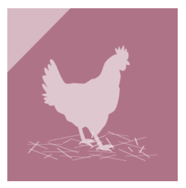
AW at depopulation – poultry eLearning module