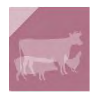
Animal disease contingency planning eLearning module