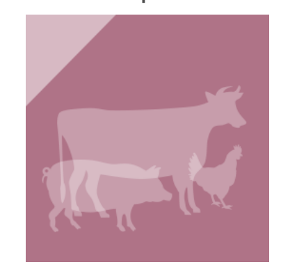
F2F- Animal welfare at slaughter – cattle, pigs, sheep & goats (advanced)