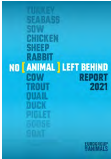
No Animal Left Behind [ Report ] also available in French