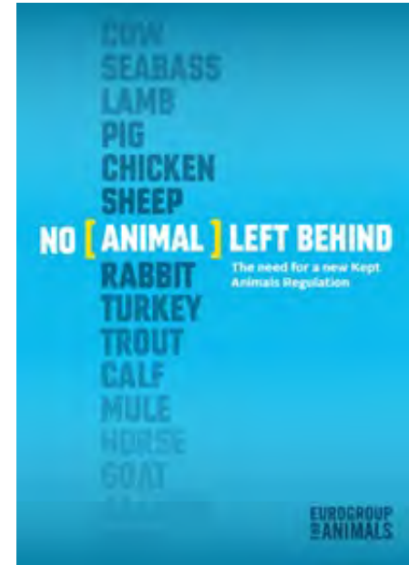
No Animal Left Behind [ White Paper ]