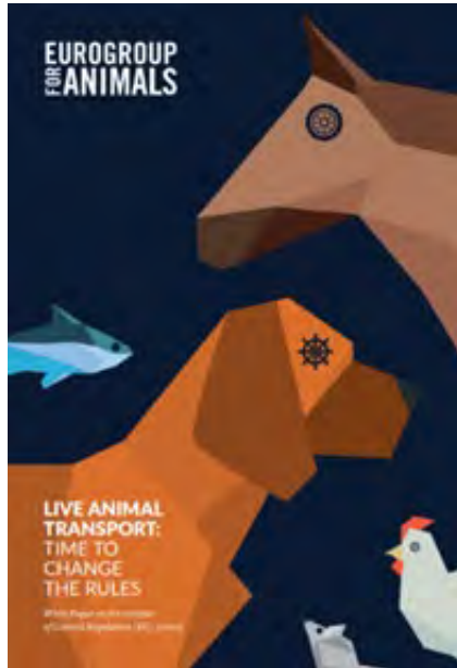
Live Animal Transport [ White Paper ]