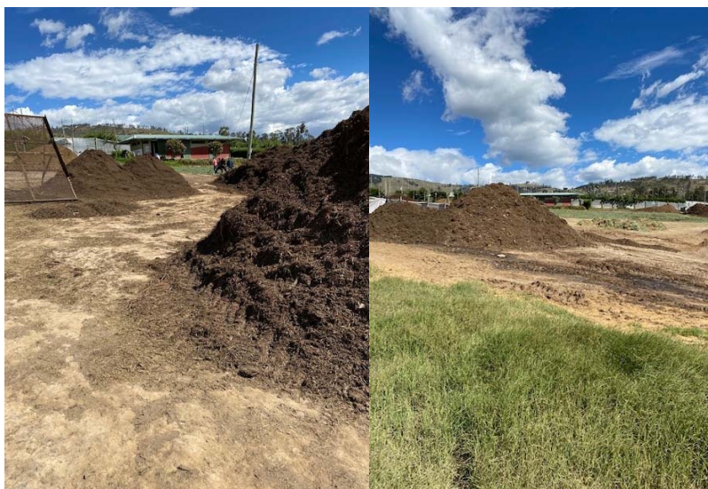
Figure 2. Appearance of transgenic carnation composting area, Ecuador.

In May 2021 the transgenic carnation production area in Colombia was surveyed for the possible presence of escaped populations of cultivated transgenic carnation. The Ecuador site was surveyed in July 2021 (figure 2). No carnation plants were found outside of cultivation at either site.