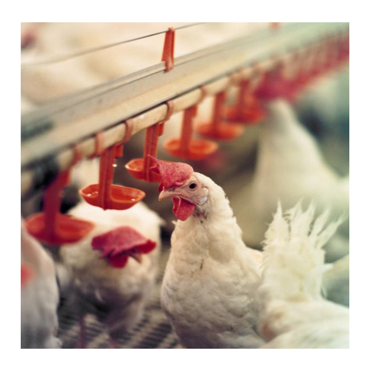
SCoPAFF October 2024