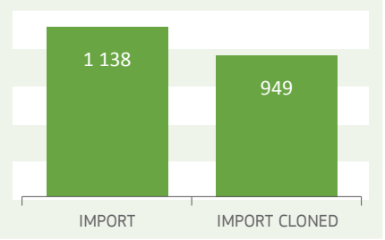
Number of consignments traded by category