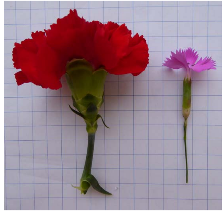
Figure 1. Copy of photograph provided with some communications.

In some communications, a photograph of a standard-type carnation flower was provided for comparison to a photograph of a flower from unimproved Dianthus caryophyllus (figure 1). This was provided as an information aid.