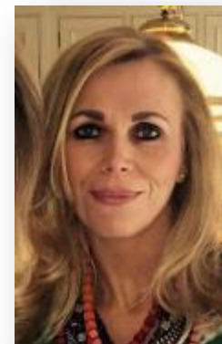
Geoghegan Fiona DG SANTE