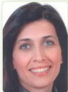
Veligrati Eleni DG SANTE