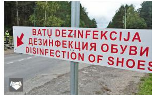
Anykščių rajonas – lyg karo fronto linija