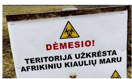
Afrikino kiaulių maro židinių geografija Europoje plečiasi