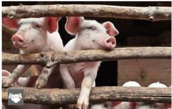
Ką reikėtų žinoti, norintiems auginti kiaules

Information campaign Articles in national newspapers and regional press, movies through TV about ASF, information per radio, preparation of leaflets, posters, signs (70929.84 EUR)