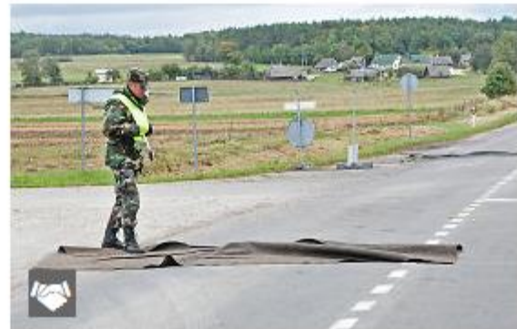
Afrikinio kiaulių maro situacija šalyje: šernai veterinarų neklausys, bet perspėjimus turėtų išgirsti keliautojai