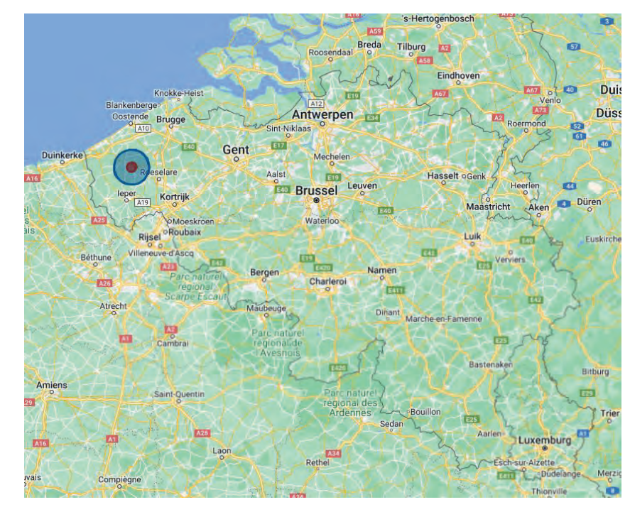
Protection zones and surveillance zones for Diksmuide 1 and 2