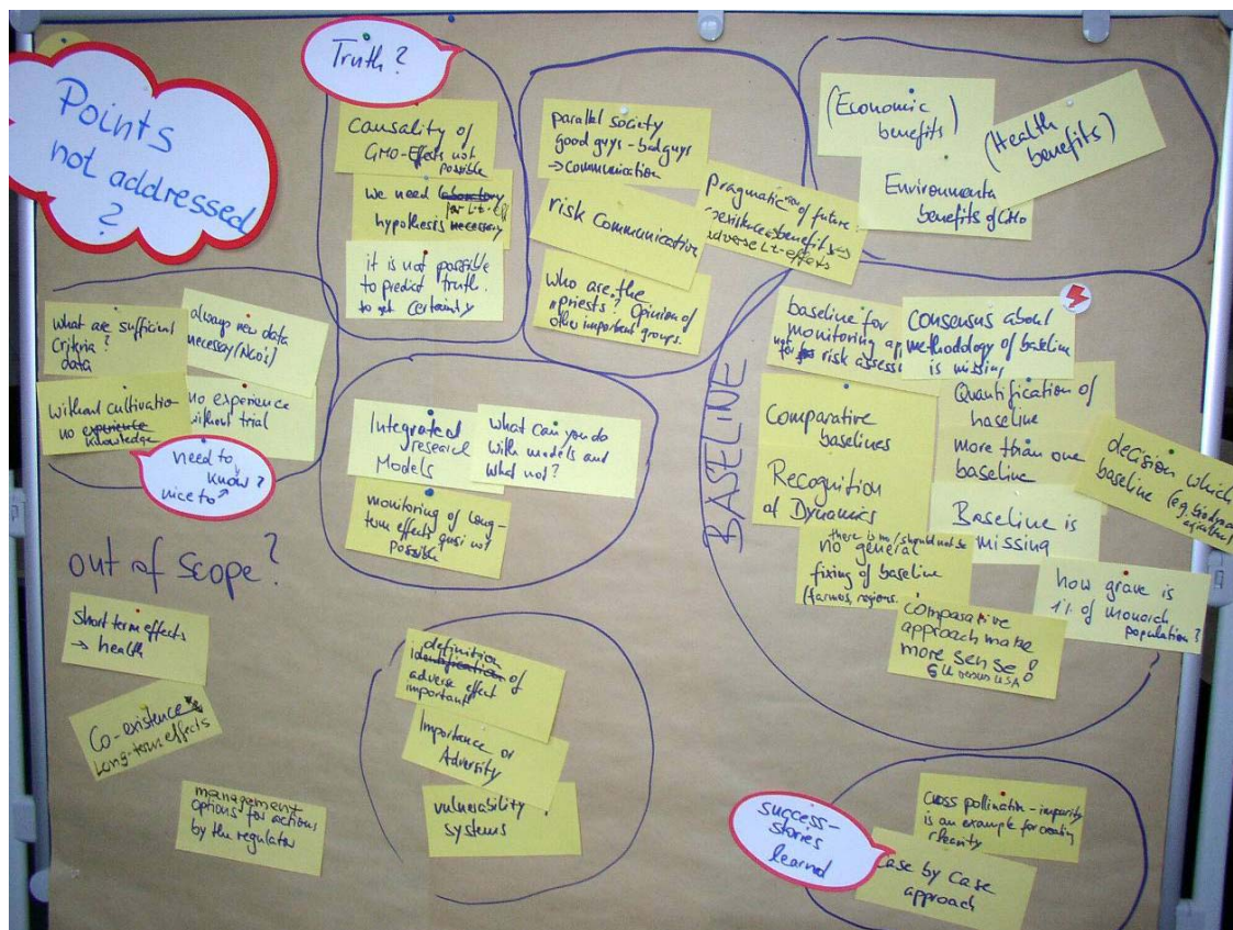
Figure 5: Documentation of the flip chart “Points not addressed”.