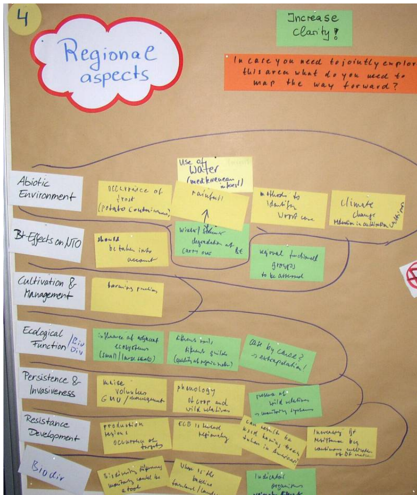
Figure 4: Documentation of the flip chart "Regional aspects", part 1 and 2