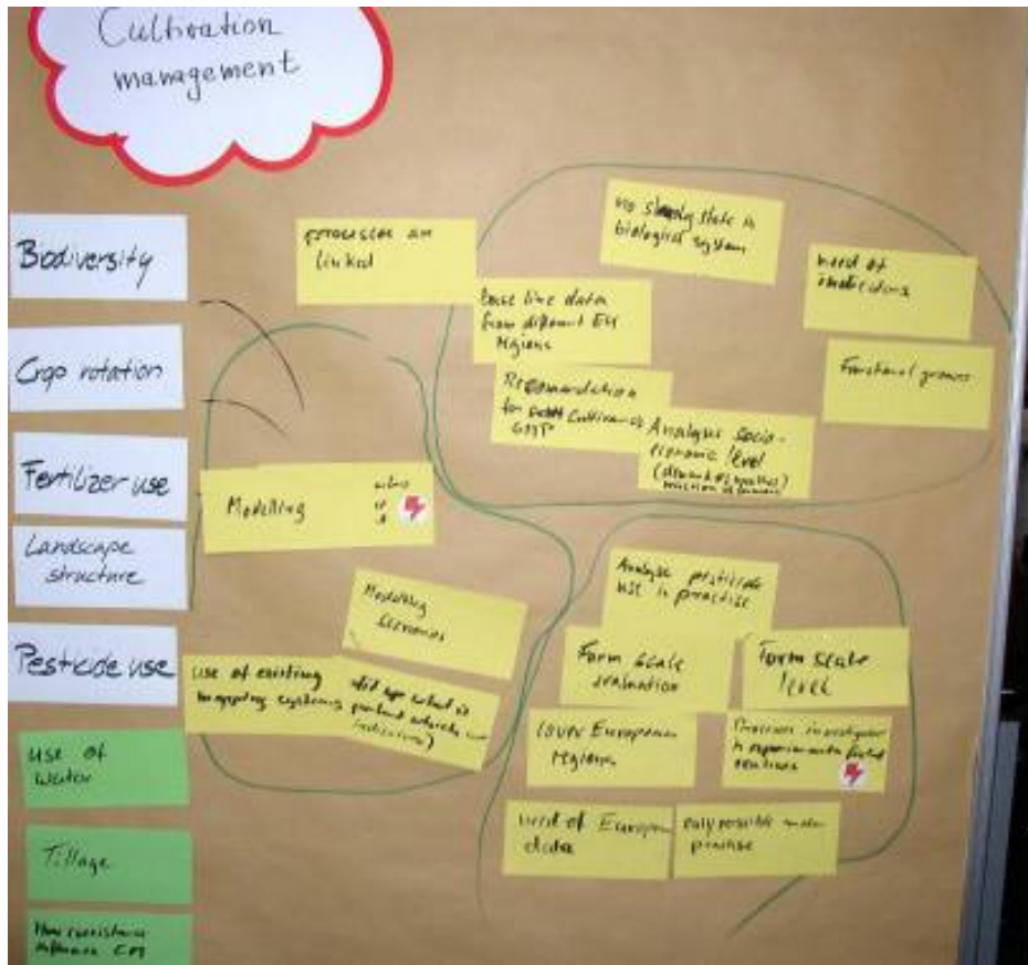
Figure 1: Documentation of the flip chart “Cultivation management”