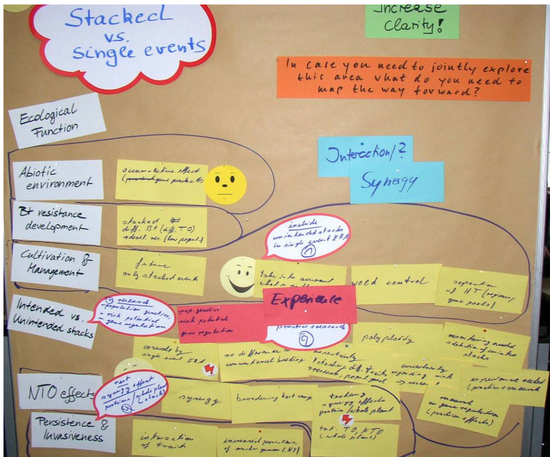
Figure 3: Documentation of the flip chart “Stacked vs. Single events”.

The groups also discussed possible long-term effects of stacked events that may arise due to the cumulative effects of gene products (e. g. Bt protein), as well as limiting the use of intended stacked events and the appearance of unintended stacked events, e. g. in order to ensure future weed control by modern herbicides (separation of HT genes by regions of gene pools). Future GM plants will probably have mostly stacked events.