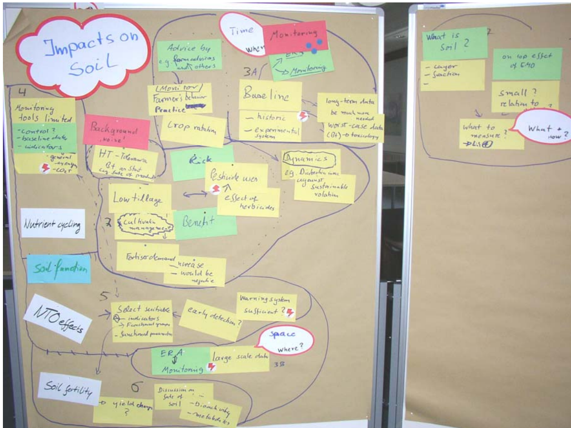
Figure 2: Documentation of the flip chart “Impacts on soil”, part 1 and 2

Concerning issue (i) most experts thought it important to define ‘soil functionality’ as the major focal point to address long-term effects. There was considerable disagreement on the exact definition of Environmental Risk Assessment (ERA) and the implications for Post Market Environmental Monitoring (PMEM). The participants stressed the importance of defining the endpoints (e.g. protection goals) for the ERA and PMEM before selecting appropriate indicator species or functionality parameters to ensure good selection.