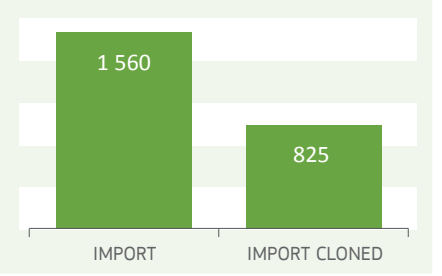
Number of consignments traded by category