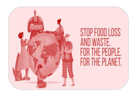
International calls to develop national strategies