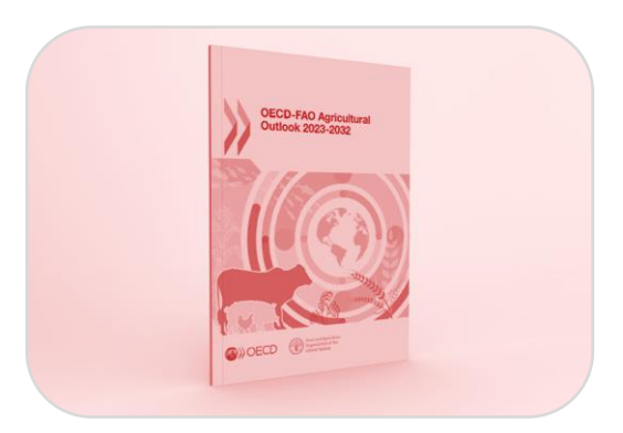
Ongoing OECD projects