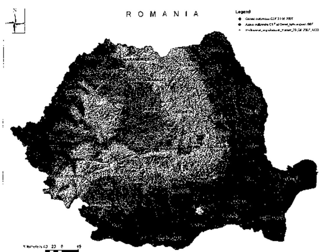
Figure 1: CSF situation in domestic pigs in Romania during 2007. Blue dots: non-professional holdings affected by CSF; Red dots: commercial holdings affected by CSF; Small blue dots: commercial holdings in Romania

During 2007 a total of 168 outbreaks were notified in 20 out of 42 counties ( Figure 1 ). The last outbreak was recorded on 9 October 2007. The vast majority of cases (165 outbreaks) occurred in the southern parts of Romania in small back yard holdings including one outbreak in free ranging pigs in a natural resort in the Braila county. However, three outbreaks occurred also in large commercial farms in the western part of Romania in August 2007 and more than 50.000 pigs were affected. No outbreaks of CSF have been notified so far in 2008.