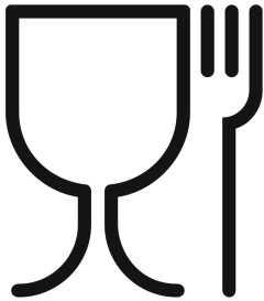
The wine glass and fork symbol for food contact use

The current legislation sets rules on labelling of food contact materials and articles so that businesses must include instructions for safe use for the consumer. The glass and fork symbol shown here should inform consumers on the suitability of an article for food contact in case it is not clear. However, previous consultation indicates that many consumers are unclear or unsure of the meaning of the logo.