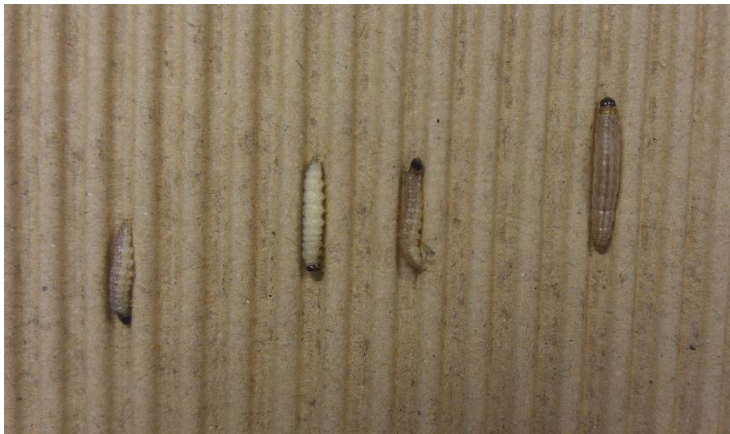
Diapausing larvae of ECB