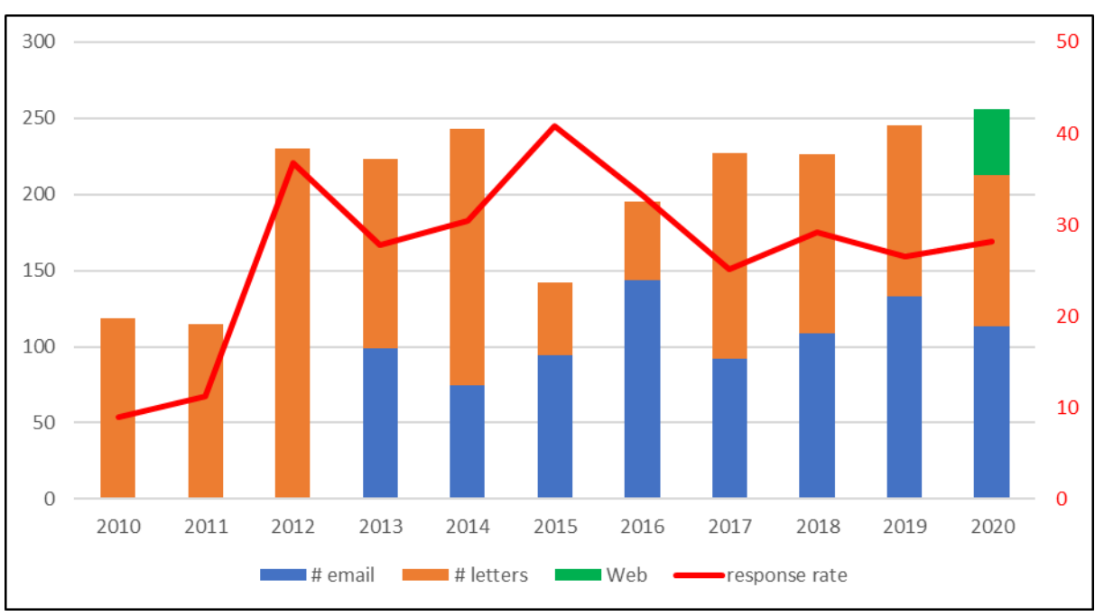
Figure 1. Number of postal and email enquiries each year since 2010 and overall response rate. Response rate is calculated from email and letter response only. The web responses, shown as the green block, are responses to the request for observations from the Telabotanica network.

Details of the information obtained from the mail out is provided in attachment 5. No respondents reported populations of carnation.