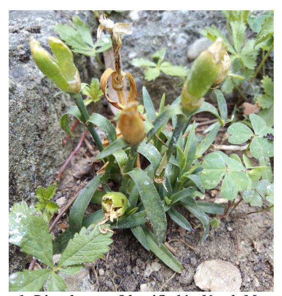
Figure 1. Dianthus sp. Identified in North Macedonia

Dates and locations of surveys are listed in table 1. For the first time since we began monitoring in 2007 the expert found what could be a carnation plant established outside of cultivation. The plant is shown in Figure 1 and appears to be white-flowered cultivar, and so not a transgenic variety.