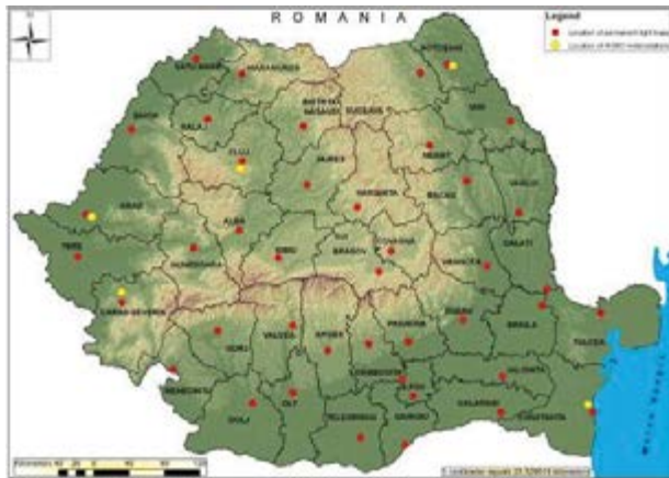
Figure 2. Site of distribution of the permanent traps (red) and HOBO meteostations (yellow) during the season 2007-2008