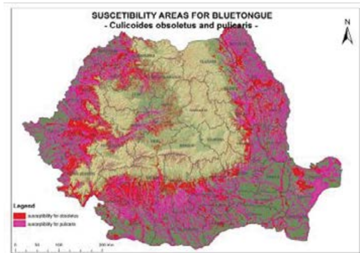
Figure 7. Map of risk areas for bluetongue (up to 500m altitude)

Figure 6. Map of favourable environmental conditions for culicoid vectors . C. obsoletus and C. pulicaris (up to 500m altitude)