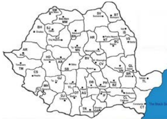
Fig. 10. Administrative map of Romania with the 41 counties and the municipality of Bucharest:

The programme will be applied to the whole territory of Romania.