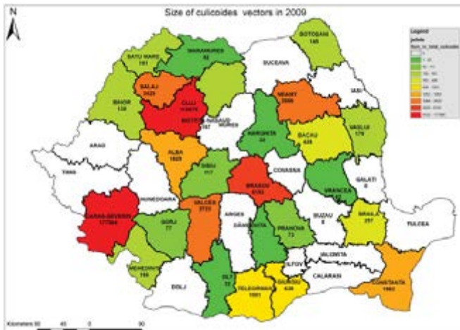
Figure 3. Sites of vectors identification in 2009.

Identified vectors: Culicoides obsoletus Culicoides pulicaris Culicoides nubeculosus Culicoides dewulfi