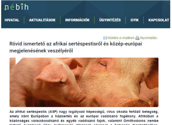
tartozó óvantagok (lágy kullancsok) játszanak szerepet a betegség fenntartásában. Európában az óvantagok ASP átvitelével kapcsolatos szerepéről még viszonylag kevés információ áll rendelkezésre

A betegség vírusellenes állatgyógyászati készítményekkel nem gyógyítható és az állatok védőoltására engedélyezett, hatékony oltóanyag (vakcina) sem áll rendelkezésre. Az ASP vírusa iránt a sertés és a vaddisznó minden életkorban fogékony és a megbetegedett állatok szinte