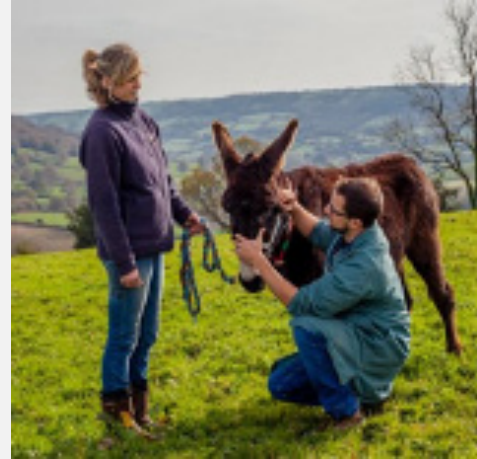
Donkey welfare assessment protocols may be used as monitoring and evaluation tools