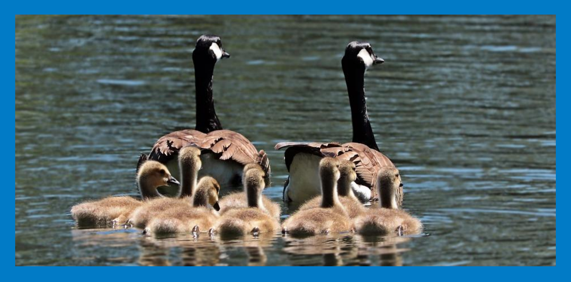
Thank you for your attention