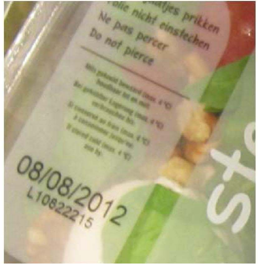
Fig. 2: Top: Red cabbage sliced in half ('packed on') and salad meal (minimum durability); Bottom: Goat's cheese and spinach, with honey, shallot sauce and pasta; Right: zooming in on 'houdbaar tot en met' (keeps until) (photo 5 August 2012)

Other examples were also photographed. The diversity was found among similar<sup>22</sup> products (e.g. fresh-cut vegetables (only washed)) at the same supermarket and among different supermarkets (e.g. fresh salmon steak). Another version of Table 3 shows that the types of date information are dealt with in various ways: