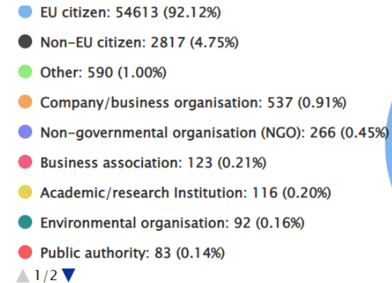
By category of respondent