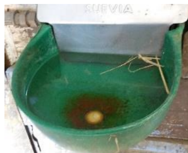
Photo 20. Water cups should be checked daily for cleanliness and functionality