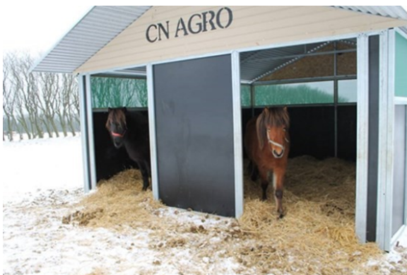
Photo 15. Shelter should be large enough to provide protection to all horses at the same time

Sufficient shelter may be provided by the natural surroundings, such as trees, hedges or other natural vegetation or by purpose-built shelters.