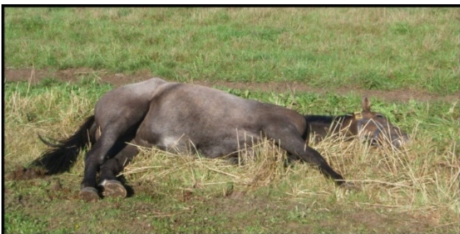
Photo 8. Horses need to lie flat on their side to enter deep sleep. The natural position is to extend the legs, neck and head.

Horses have different phases of sleep. In particular, horses require a phase of sleep during every 24hour period where they are lying down on their sides with their limbs extended and their muscles relaxed. To achieve this they need to feel safe, have enough space and a dry lying area. It is important to keep this in mind for the size and type of accommodation for horses.