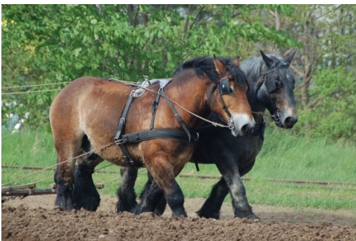
Photo 23. Working horses used for agricultural purposes.

As with any other horses their basic needs have to be fulfilled and capability of workload considered. Please refer to chapter 7.12 on welfare of working equids in the OIE Terrestrial Animal Health Code for detailed consideration of the working horse welfare needs.