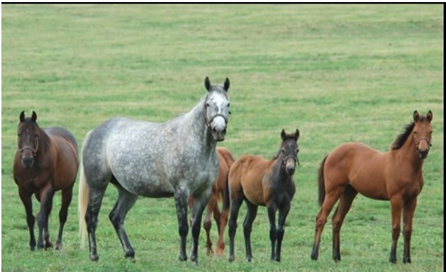
Photo 16. It is recommended that horses are given daily access to a paddock or pasture, where possible with other horses.

It is recommended that all horses should be given daily access to paddocks or pasture, where possible together with other horses, in order to fulfill their need for free movement and social contact. However, there may be situations where veterinary advice or extreme weather conditions make this contradictory.