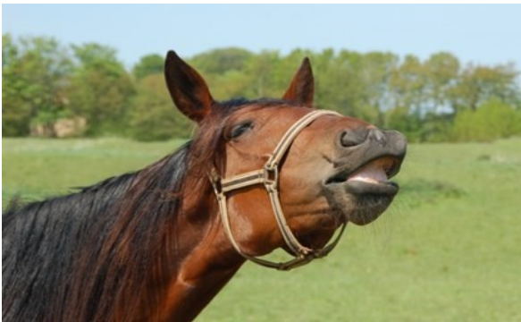
Photo 3: Flehmen enables the horse to investigate a scent more closely

Horses are gregarious/herd animals. Under natural conditions horses live close together in stable groups. The groups typically consist of one, or sometimes more than one, adult stallion and a number of mares with offspring, including young males. Young stallions and older stallions without a group of mares also group together. The group stabilises itself with a social order, which is challenged when new members are introduced. A new social order is typically formed within a few days to weeks. Living in stable groups has a number of advantages, mainly in relation to social transmission of behaviour, seeking feed and water, and a defence strategy to avoid or minimize encounters with predators. As an example, all horses of a group rarely lie down together. One will remain standing and guard the group. Horses will generally become anxious and insecure when isolated from other horses. In domestic horses, lack of social contact both early and later in life may cause development of abnormal behaviour such as weaving in stabled horses, or more aggressive interactions when on pasture with other horses. Furthermore, group housed young horses are easier to handle and train than young horses kept individually.