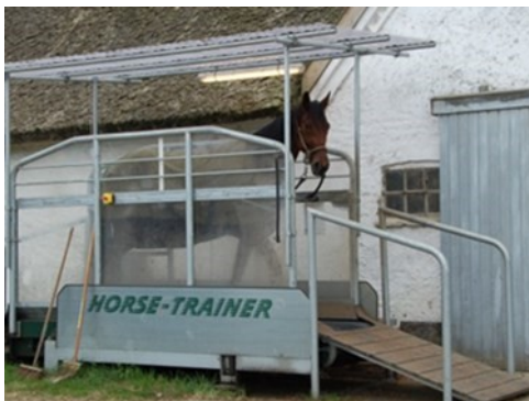
Photo 21. Horses should be supervised by a competent person at all times when exercised on a treadmill

Mechanical equipment such as horse walkers and treadmills are used for exercising horses.