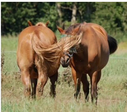
Photo 7. Horses standing close to keep insects away from each other's head.

Although horses are social animals, they have a social space, which defines the distance that they wish to keep from other horses. This distance is individual, and is dependent on age and on how well the horses know each other. During social grooming, for example, the distance is zero. Horses may also be seen standing close together when trying to keep insects away. Foals and young horses appear to have a very narrow or less developed social space and they may be seen lying close together. When horses are group housed, it is important to take social space into account when deciding how much space they should be given.