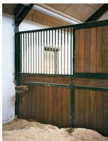
Photo 13. Individual boxes, which allow horses to see each other.