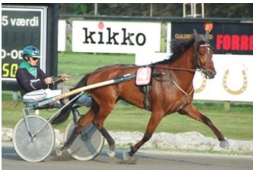
Photo 18. Some groups of horses may need to be supplemented with high energy feed.

Many horses can live on grass or roughage alone, supplemented with vitamins and minerals if necessary. Some groups such as sport horses, young, growing horses or horses meant for breeding purposes may have a need for a higher energy consumption due to their level of exercise or basic needs. Therefore, they may need to be supplemented with high energy feed (concentrate).