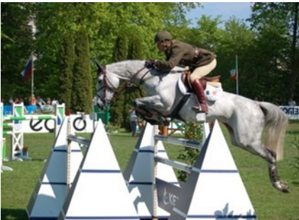
Photo 24. Show jumping.

Most sports organisations (racing, riding, driving etc.) have standards or codes of conduct, which aims to help ensure the welfare of horses while they are taking part in competitions.