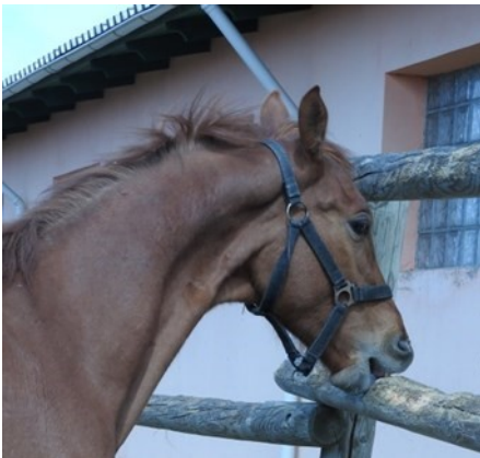
Photo 9. Crib biting may be performed on any suitable surface

Abnormal behaviours are seldom or never seen in horses that live under natural conditions. Abnormal behaviour is a sign that the environment and/or the conditions, in which horses are kept or have been kept, do not fulfil their needs. Permanent dysfunction of the central nervous system in response to stressful conditions may mean that developed stereotypies may not resolve despite later changes to the environment or conditions. Many abnormal behaviours are stereotypies such as crib biting, wind sucking, stable walking, weaving and auto-mutilation (e.g. biting themselves). Horses may also exhibit compromised welfare in subtler ways such as becoming apathetic and withdrawn.