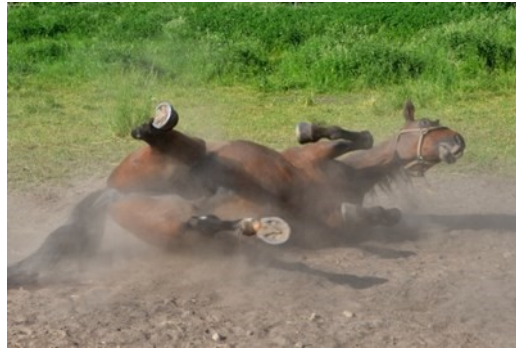
Photo 6. Rolling in sand.

Although horses are social animals, they have a social space, which defines the distance that they wish to keep from other horses. This distance is individual, and is dependent on age and on how well the horses know each other. During social grooming, for example, the distance is zero. Horses may also be seen standing close together when trying to keep insects away. Foals and young horses appear to have a very narrow or less developed social space and they may be seen lying close together. When horses are group housed, it is important to take social space into account when deciding how much space they should be given.