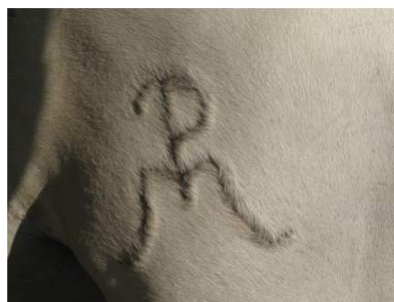
Photo 27 and 28. Tail docking and hot iron branding should be strongly discouraged.