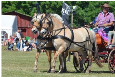
Photo 25. Driving.

This may include rules on what equipment and tack can be used (for example whip and spurs), on training and correction methods during warming-up and competition, on when pregnant mares can no longer compete or race, on use of equipment as a coercive measure, and on illegal substances or methods (doping).