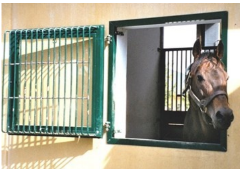
Photo 11. Window with a grid.

Windows in accommodation for horses should be made of unbreakable glass or be protected by an appropriately constructed grid or the like to prevent horses from breaking the glass and injuring themselves.