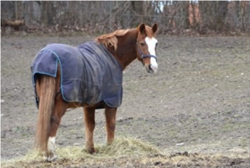
Photo 22. Horse with a winter rug

During cold winter months, waterproof and breathable turnout rugs may be used to protect horses from adverse weather conditions.