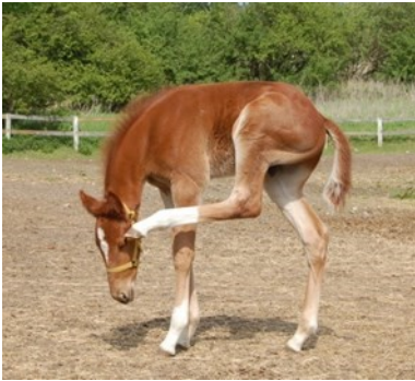
Photo 5. Scratching with a leg.