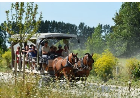
Photo 26. Carriage horses used in tourism.

Horses are used in connection with tourism in different ways. This may be horse trekking, including carrying tourists to sites of interest with or without a guide, or as carriage horses to drive tourists on sight-seeing tours, use as different kinds of pet-animals etc.