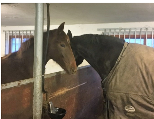
Photo 12. Individual boxes, which allows horses to touch each other.

Individual (loose) boxes should be dimensioned to fit the size of the horse, so that the horse can lie down in a natural lateral position (see photo 8), turn around and get up unimpeded, and stand in a natural position. Boxes for foaling or boxes for a mare with foal at foot need to be larger than boxes for single horses. When considering space requirements, the time the horse spends in the box should be taken into account. The box should be larger if the horse is stabled for a major part of the day. The upper part of partitions between boxes should not be solid, but allow horses in neighboring boxes to see each other and allow for adequate ventilation. Fittings, such as feeding and watering equipment, should be positioned, designed, and maintained in a way as to avoid injury to the horse, and as far as possible avoid contamination with urine and faeces.