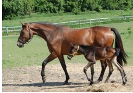
Photo 29 and 30. Foals should drink colostrum within a few hours after birth, and they should be given time in a paddock or on pasture from day one.

Colostrum protects the foal from possible disease agents in the environment. It is therefore vital that the foal drinks milk from the mare within a few hours of birth. If this isn't possible, for example due to a problem with the mare, then veterinary advice should be sought without delay.