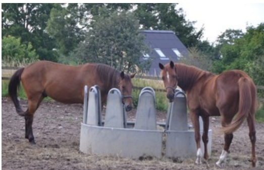
Photo 17. Horses should have access to roughage both when they are stabled and in paddocks without grass.

Chewing promotes production of saliva that acts to neutralise the continuous production of acid in the stomach. To prevent stomach ulcers and enhance gut health horses are dependent on near-continuous access to roughage.