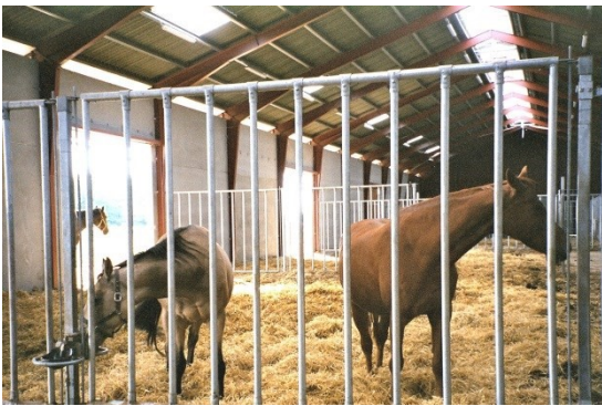
Photo 14. Horses in a group housing system with access to an outside run.

In group housing systems the total floor area should allow free movement, sufficient access and space at feeding and watering stations, and ensure a dry bedded area large enough to allow all horses to lie down undisturbed at the same time. Fittings to allow temporary tethering of horses, for example when a concentrate ration is fed, should be considered. Care should be taken to select groups of horses that are compatible. Ill or injured horses or horses with deviating behavior (for example aggressiveness) should be managed accordingly and group housing may not be suitable for such individuals. Facilities for temporary separation of individuals should always be available. The design of the group housing system should ensure that all horses are able to move away from each other and to access feed and water at any time. Dead-ends and sharp corners should be avoided to prevent horses from being trapped.