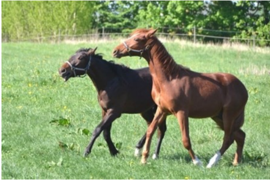
Photo 10. Social contact is important for horses.

As mentioned above, horses are gregarious animals, and lack of social contact with other horses both early and later in life may cause development of different abnormal behaviours and lack of development of normal social behaviour. Horses prefer full physical direct contact in paddocks, on pasture or in group housing.