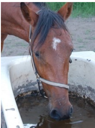
Photo 19. Horses prefer to drink from an open water surface

Horses prefer to drink from a water surface, but learn without difficulty to drink from a water cup. When automatic drinking systems are used, they should be checked daily and should have a water flow of approx. 8 liters per minute in order to ensure sufficient water intake.