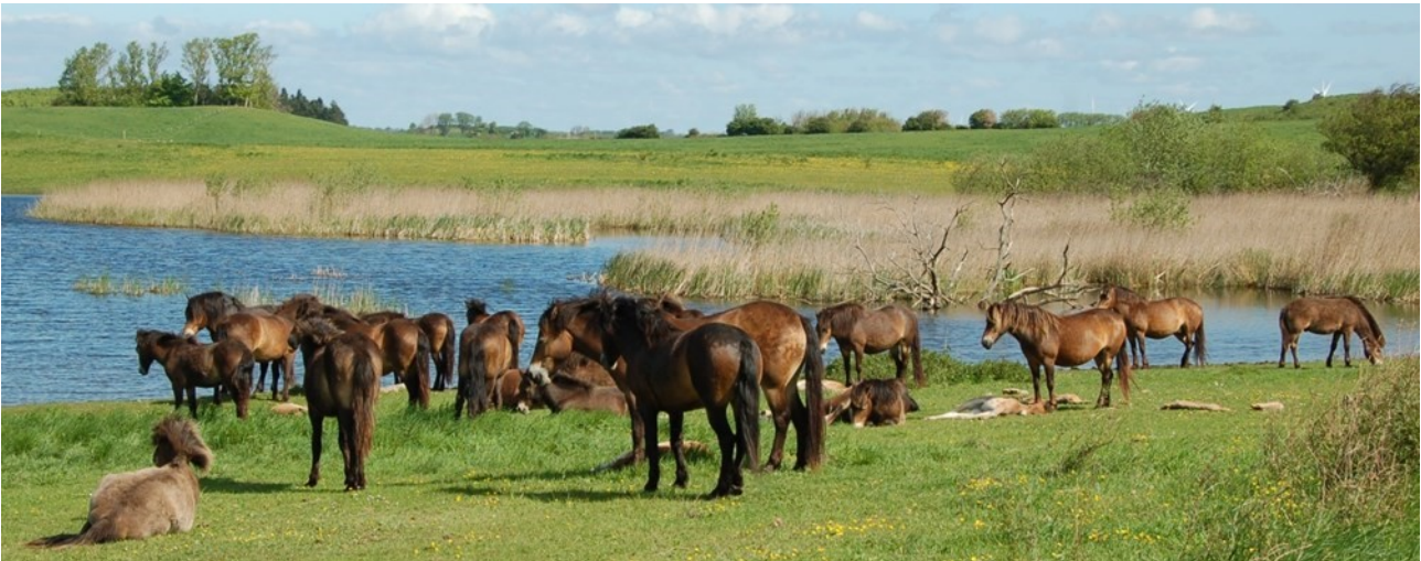
Photo 1. Knowledge on the natural behaviour of horses derives mainly from studies of feral horses.

Today’s domestic horse, the Przewalski’s horse and other feral or wild horses such as the now extinct tarpan, share a common ancestor. Knowledge on natural horse behaviour derives partly from studies on Przewalski’s horses reintroduced to their original habitat, but mainly from studies of feral horses - offspring of escaped domestic horses that live under natural or semi natural conditions with no or little human interference.