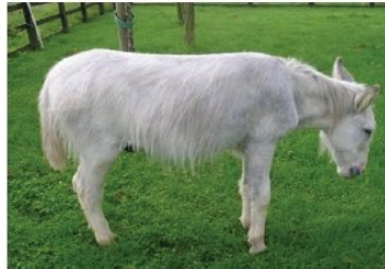
Hyperlipaemia is a common reason for euthanasia and also a frequent cause of death afterwards in bonded-donkey companions