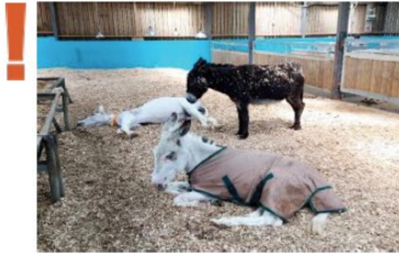
Allow donkeys sufficient time to accept the loss of a pair-bonded companion.