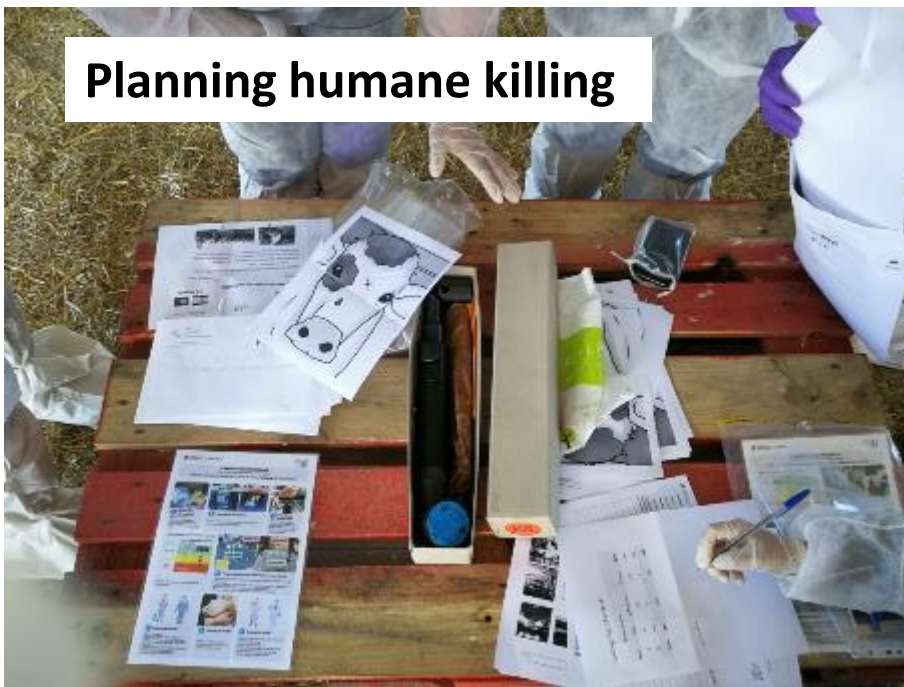
Planning humane killing