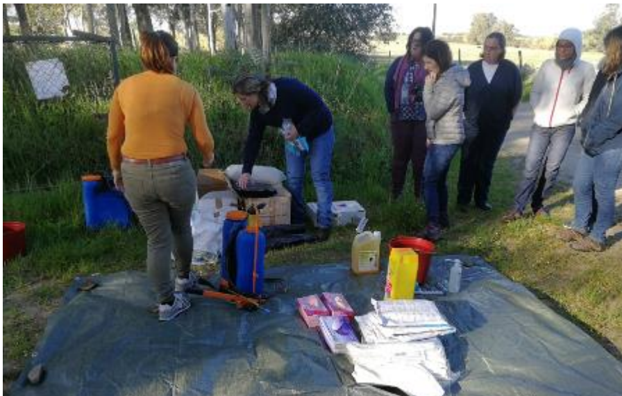
13.03.2019 – Farm at Reguengos de Monsaraz