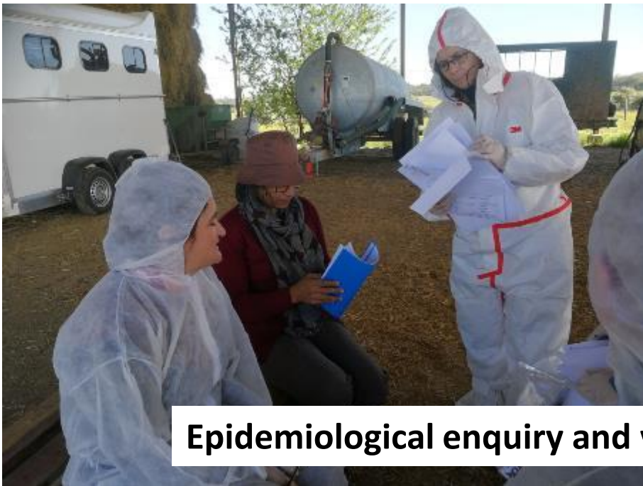
Epidemiological enquiry and visit to the farm to check biosecurity