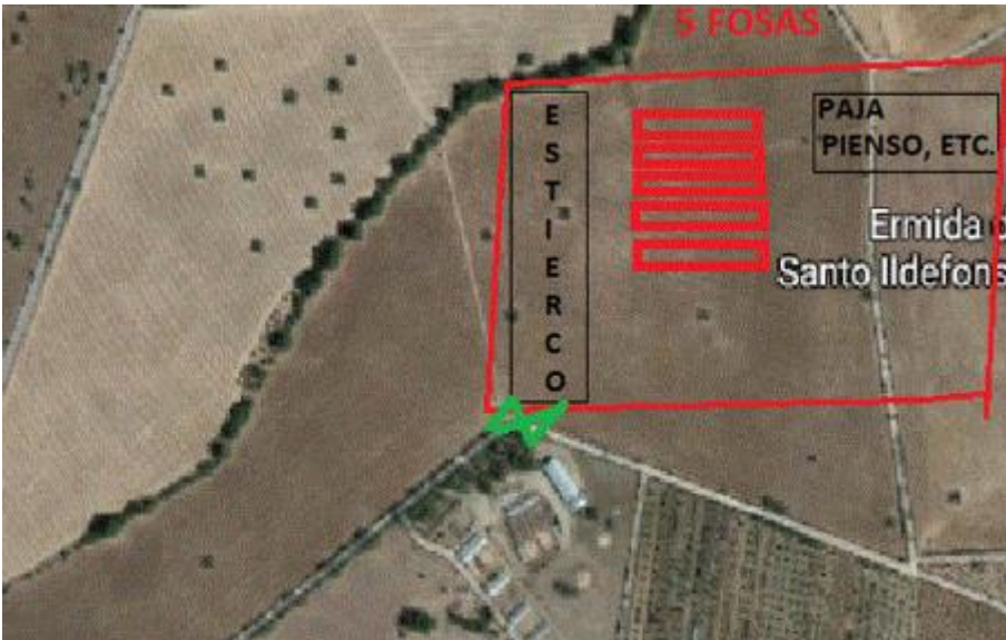
Planning safe disposal and destruction of biologic materials