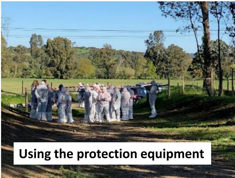
Using the protection equipment