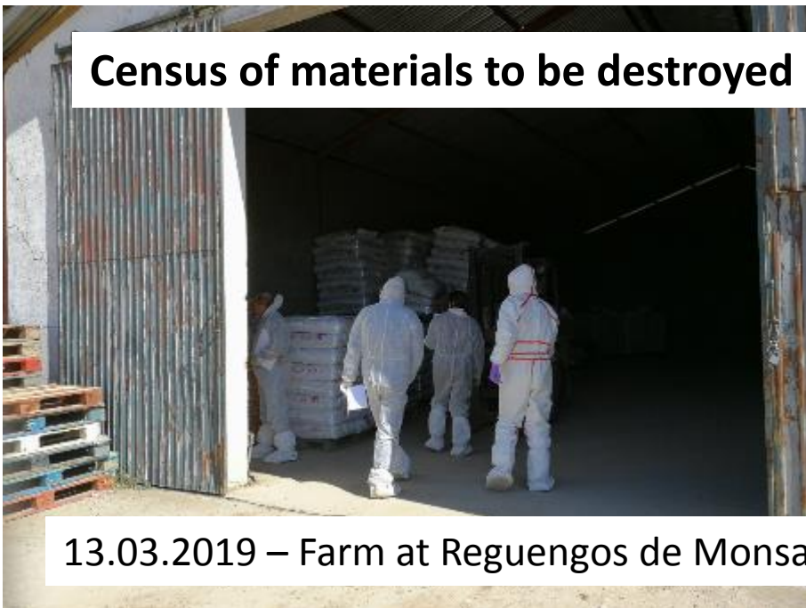
Census of materials to be destroyed and filling the forms for compensation