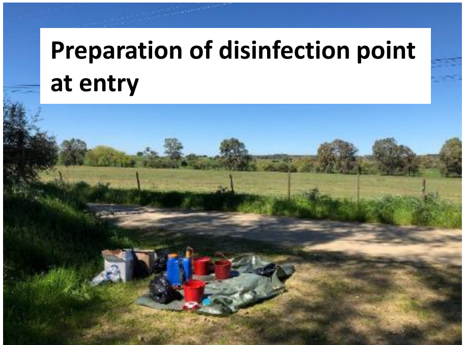
Preparation of disinfection point at entry