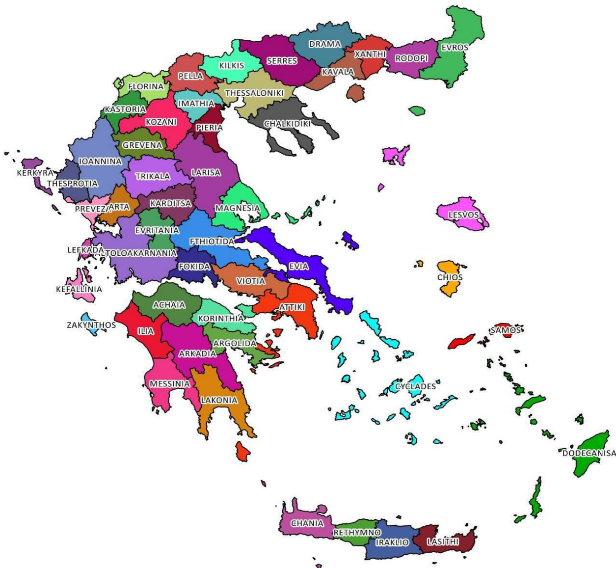
Map II. Administrative division of Greece in Regional Units.