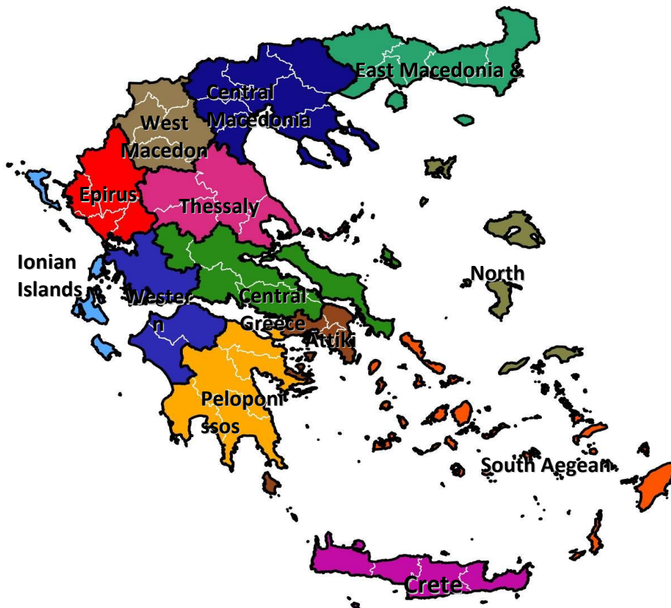
Map I. Administrative division of Greece in Regions