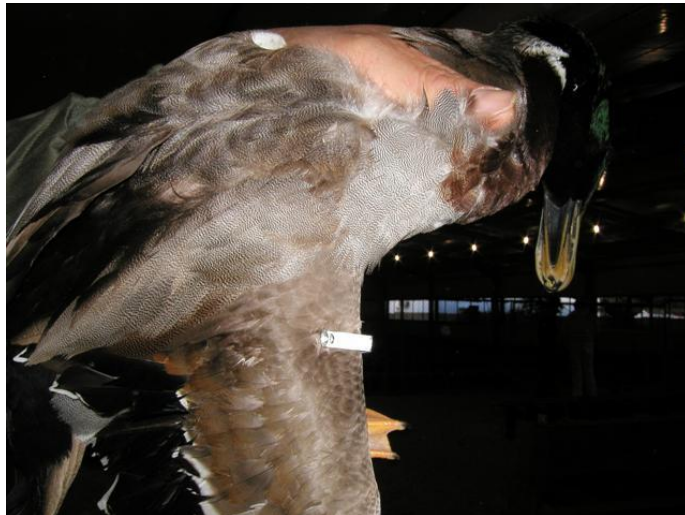
Wing tags Vaccinated