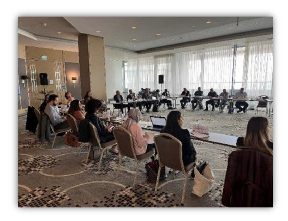
Output 1.5. Support the broader involvement of teachers' organisations to the elimination of WFCL in seasonal agriculture

In conclusion, the coordination mechanism managed by the Ministry was perceived as the best coordination mechanism by all the partners. The meeting was conducted successfully with the participation of more than 30 participants.