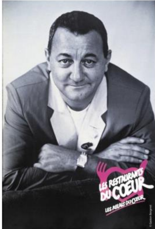
Coluche, French comedian

Coluche founded "Les Restos du Cœur" in 1985, with one purpose : « to help and provide assistance to those in need, particularly regarding food insecurity, through access to free meals. Thereby encouraging social inclusion as well as any action against poverty in all its forms »