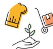
Working inclusion sites