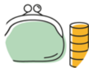
Budget guidance and microcredit