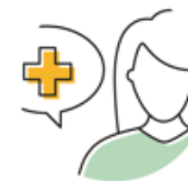
Access to health