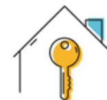
Access to housing