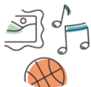
Access to leisure and recreational activities