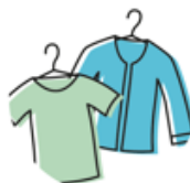
Access to clothing