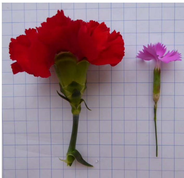
Figure 1. Copy of photograph provided with some communications.

In some communications, a photograph of a standard-type carnation flower was provided for comparison to a photograph of a flower from unimproved Dianthus caryophyllus (figure 1). This was provided as an information aid.