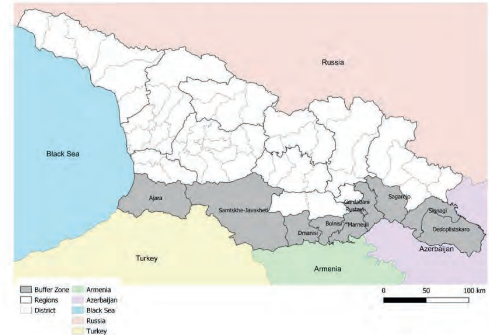
Figure #7: FMD vaccine (Eritrea 98 strain - EU Donated) to be distributed