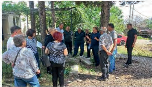
Figure #15: Face to face meeting with field and regional veterinarians ;