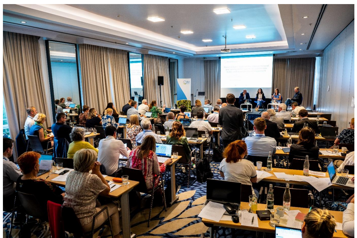
Workshop on the role of the sector on sustainable water management and biodiversity, Brussels, June 2023

- Via our social media channels on 4 thematically relevant UN days (Day of Awareness of Food Loss and Waste, International Day for Biological Diversity, two thematically relevant days of COP28)