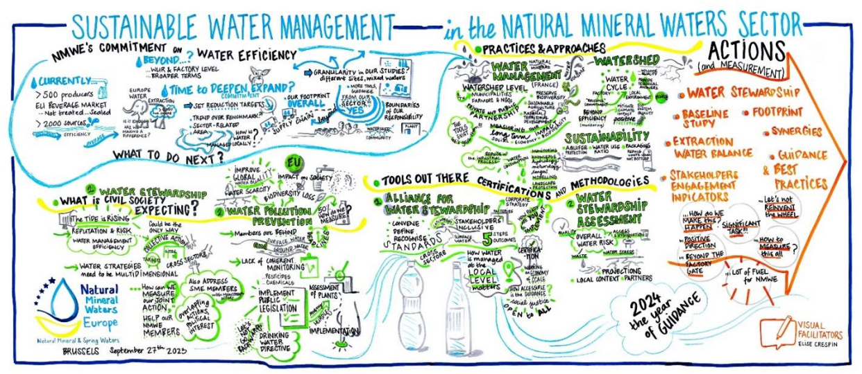
Graphic recording from the Expert Workshop on Sustainable Water Management, September 2023.

- Sectoral activities on Water Stewardship. There has not been a concrete tooldevelopment work since the workshop; the time in between has been dedicated to improving knowledge, defining NMWE's role, and engagement with other stakeholders (Alliance for Water Stewardship, World Resources Institute, WWF...). More concrete activities are expected to be formulated after the official update of the commitment (see Section 2 of this report).