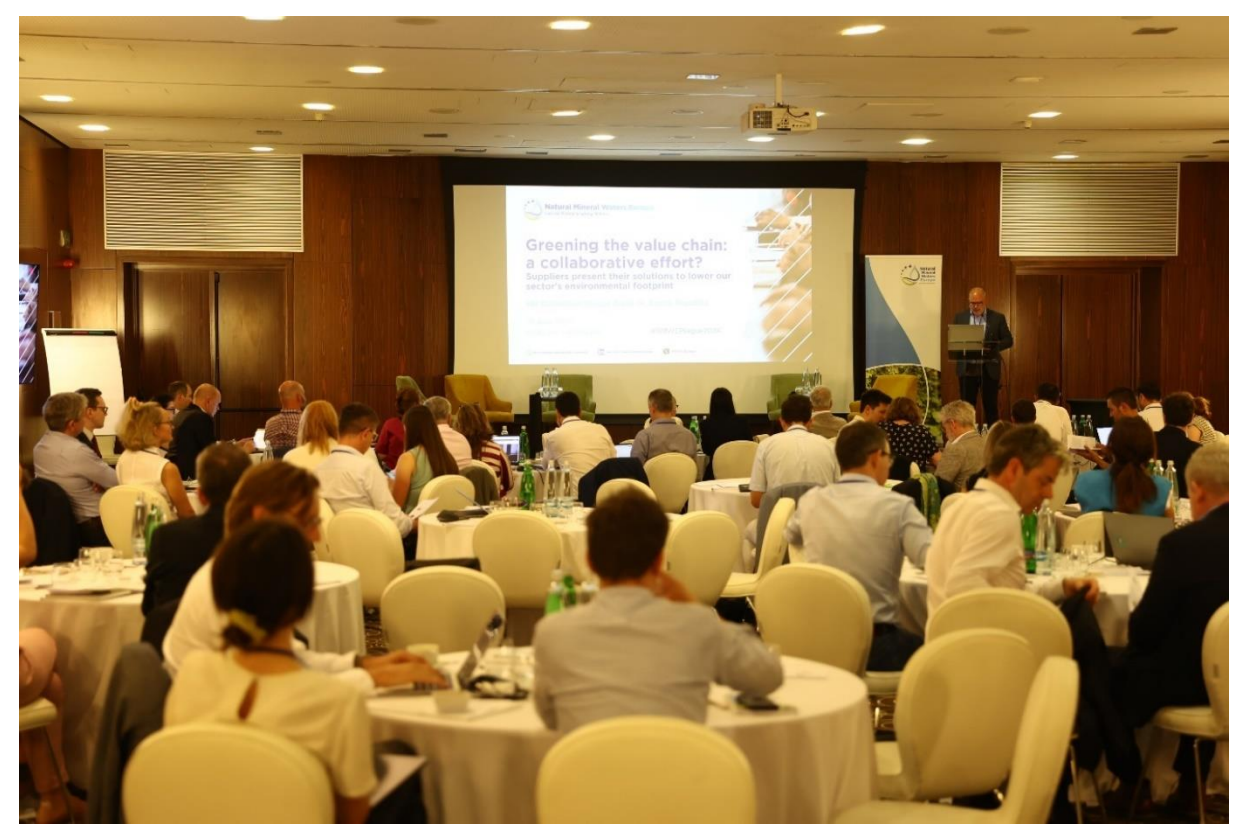
NMWE's supply chain decarbonisation workshop in Prague, June 2024.

Following the completion of the study, activities have started to identify and address gaps in legislation, standards, and knowledge and engaging with relevant stakeholders are all underway. This has practically resulted in a decarbonisation workshop at NMWE's annual meeting in June 2024 engaging major suppliers to address Scope 3 emissions and enabling action in Scope 1-2 emissions too.