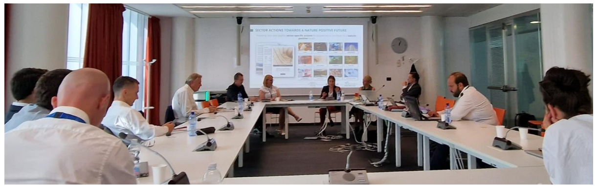
European Business and Nature Summit, Milan, October 2023.

Since then, the project has continued according to the plan. Following a review of biodiversity commitments and policies in the spring and summer of 2023, 2 online workshops with NMWE members and 2 physical workshops with both members and external experts provided by IUCN have taken place. The process was presented also during the side of event of the European Business & Nature Summit 2023 in Milan, Italy.