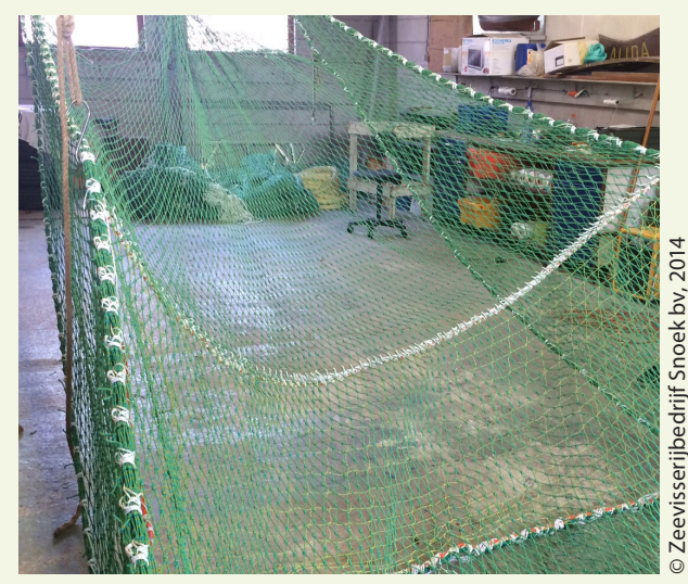
More selective fishing net

The project results showed a reduction in discards thanks to the new fishing net (10-15 % of estimated discards after the project versus 22 % discards before). However, catches are lower too since some of the fish targeted escape through the net. The automated discard separation system is meant to minimise the additional on-board work load caused by the obligation to land all catches. Thanks to the use of wet tanks at the beginning of the processing chain, caught fish stay alive until sorting and may thus have higher chances of survival when discarded. Research is still ongoing to measure survival rates.