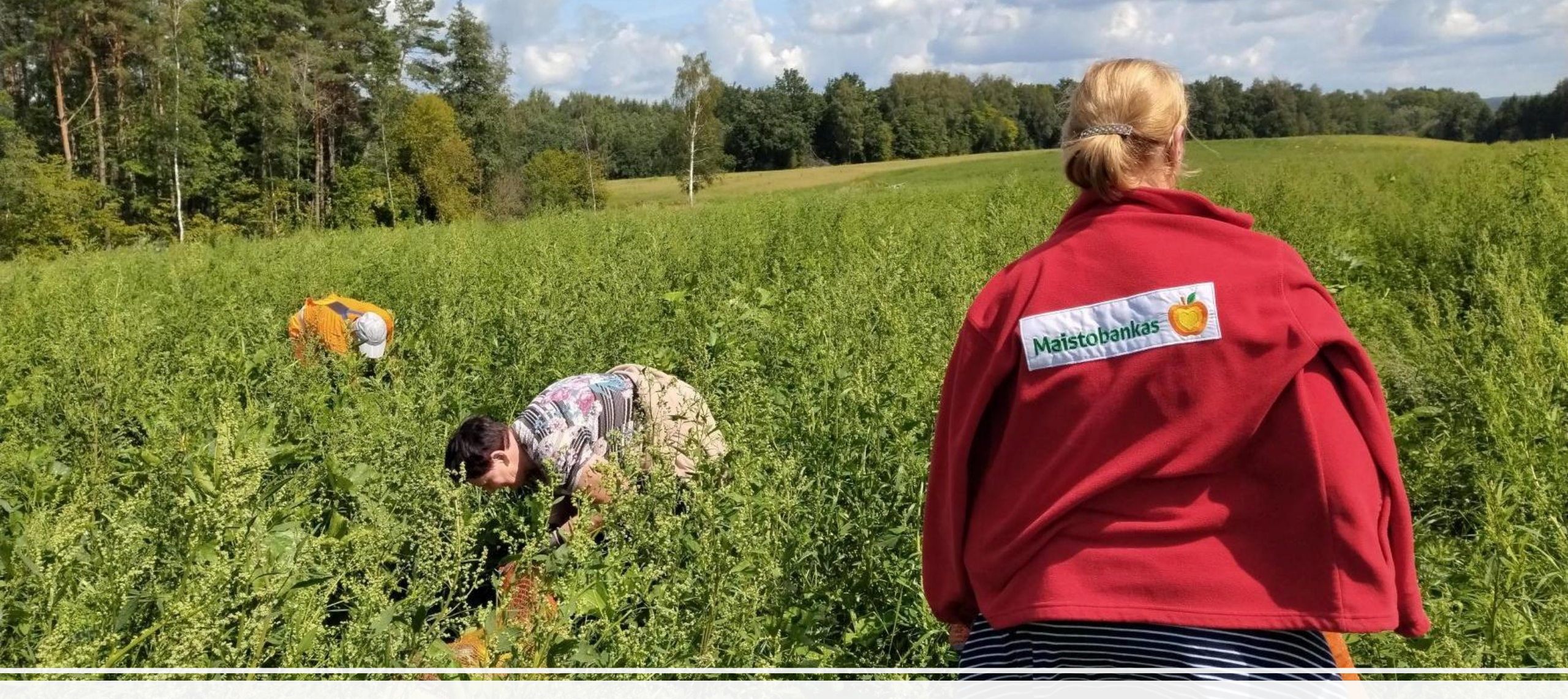
What are we doing to rescue more from agriculture?